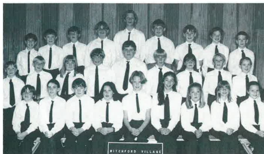
Above: The class of 1991 at Witchford Village College. The school would love to hear where you are now and what you are doing.

Witchford Village College is one of a thousand state secondary schools