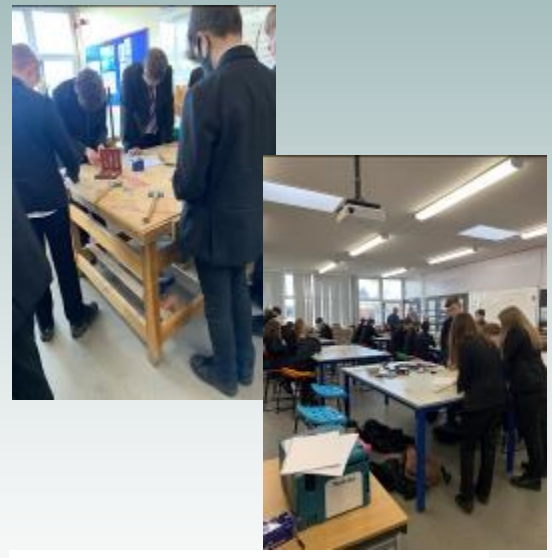
Students engaging with hand on tools

Witchford Village College welcomed Cambridge Regional College on the 23rd February 2022 for an event delivering a range of vocational subjects to Year 9 students. The tutors that came from CRC were all specialists in their field and the students were able to engage in subjects such as Engineering, Construction, Art, Computing, Sport & Uniformed Services and Care, Health & Early Years. The morning progressed really well with our students being able to consider some of the options that may be available for the future. We were also lucky enough that some of the present students from Cambridge Regional College, who were studying the subjects, were able to support and talk to students about life at CRC.